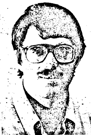
THE WINDSOR LOCKS JOURNAL, THURSDAY, OCTOBER 6, 1977

After college he returned to his home town and became a math teacher at his own high school. He said, being on the other side of the desk presented a different picture. During his five years at the Raider school he has coached the Girls J.V. basketball team and has been active as a track and cross country official.