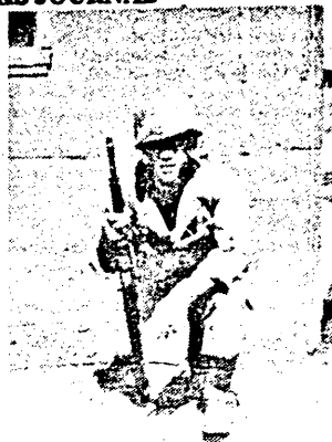
THE WINDSOR LOCKS JOURNAL