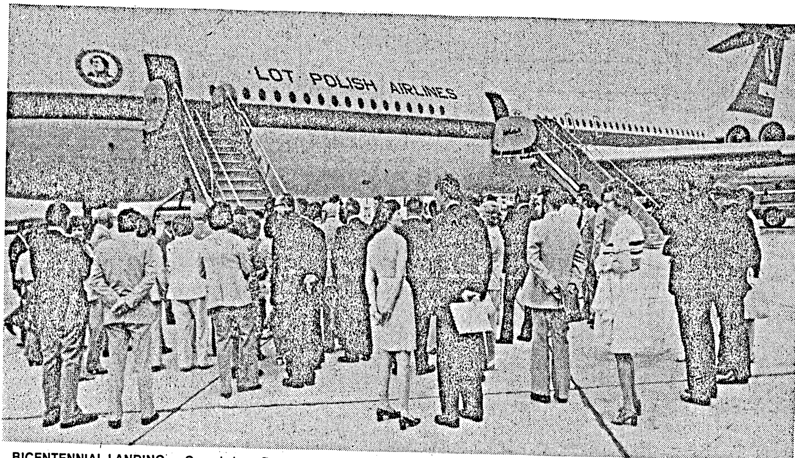
BICENTENNIAL LANDING — Crowd views Russian-built jet owned by LOT (Polish National Airlines) Monday, first Polish craft to land at Bradley International Airport in Windsor Locks. Plane took

off for Warsaw after ceremonies. It stopped here in honor of American Bicentennial.